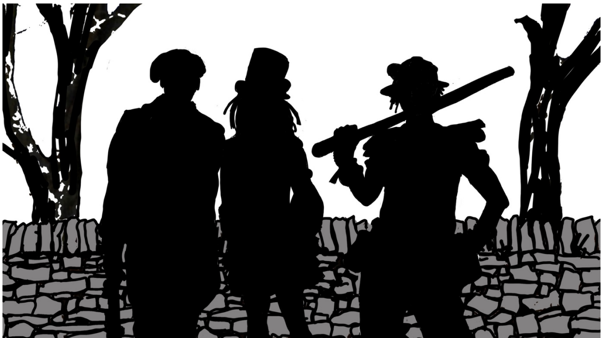
They meet the Stone City Rebels - together they explore the mine and the buildings to try and find answers.