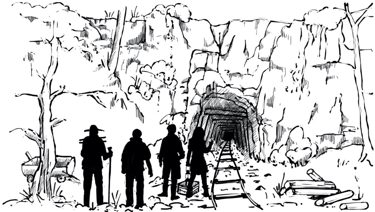
The wilderness people go to the mine in the Sacred Mountain